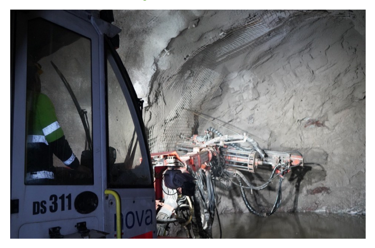
Figure 2: Underground at the Upper Portal