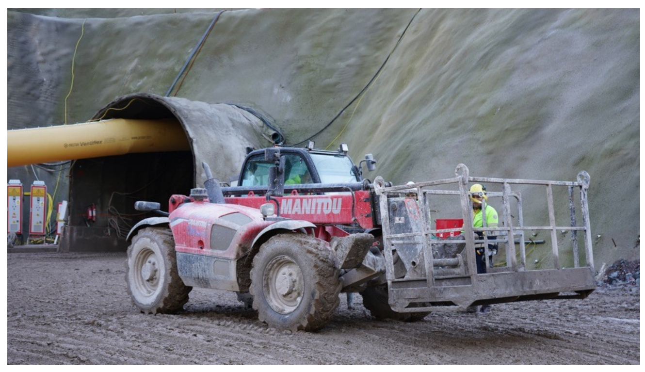
Figure 3: Lower Decline Portal