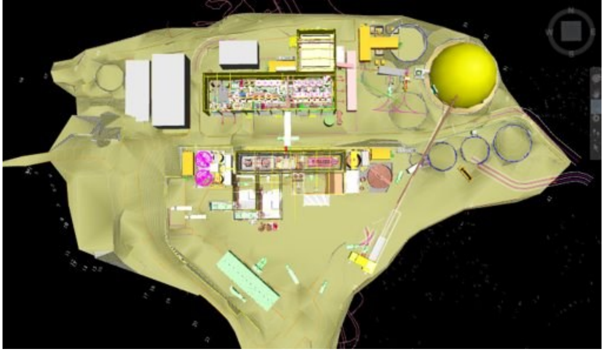
Figure 7: Vares Processing Plant Progress – 3D model