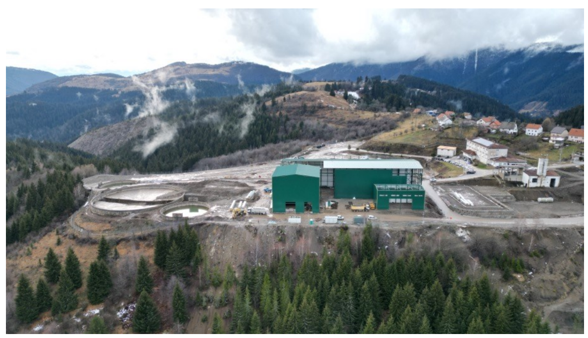
Figure 6: Vares Processing Plant