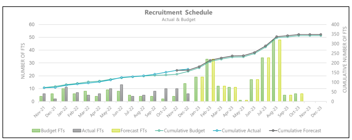
Figure 11: Eastern Mining Full Time recruitment 'S' curve