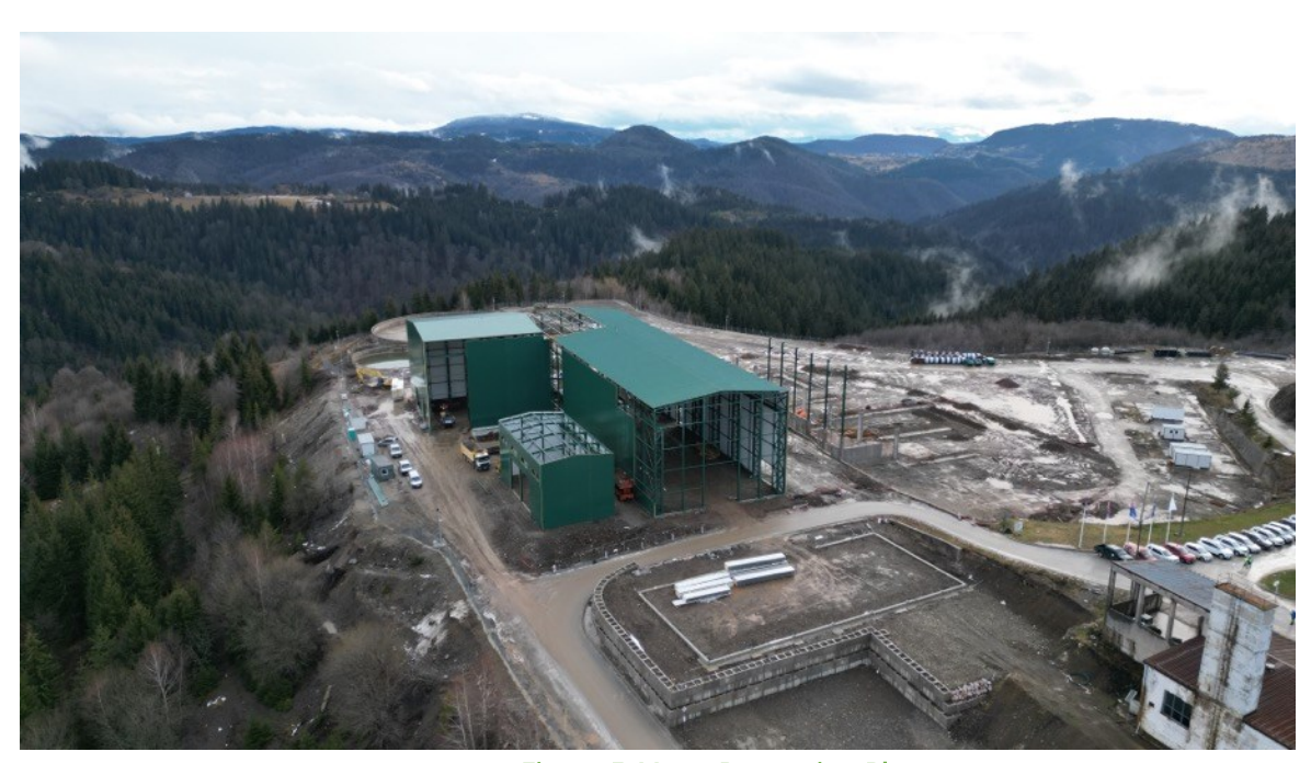
Figure 5: Vares Processing Plant

In Q4, an internal technical review of the process flow sheet was undertaken by Ausenco Metallurgical Group. In order to maximise the returns of the Project, a decision was taken to install two Jameson Flotation Cells, which, based on comparable fine grinding flotation plants, are proven to work effectively. This should lead to maintained concentrate grade and improved recoveries once in production, for a relatively small additional investment, which is to be funded out of the existing debt facility.