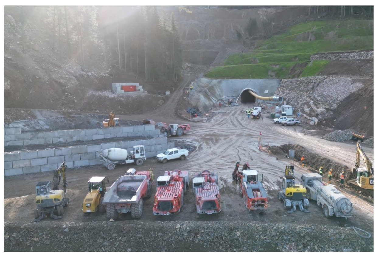
Figure 1: Lower Decline Portal