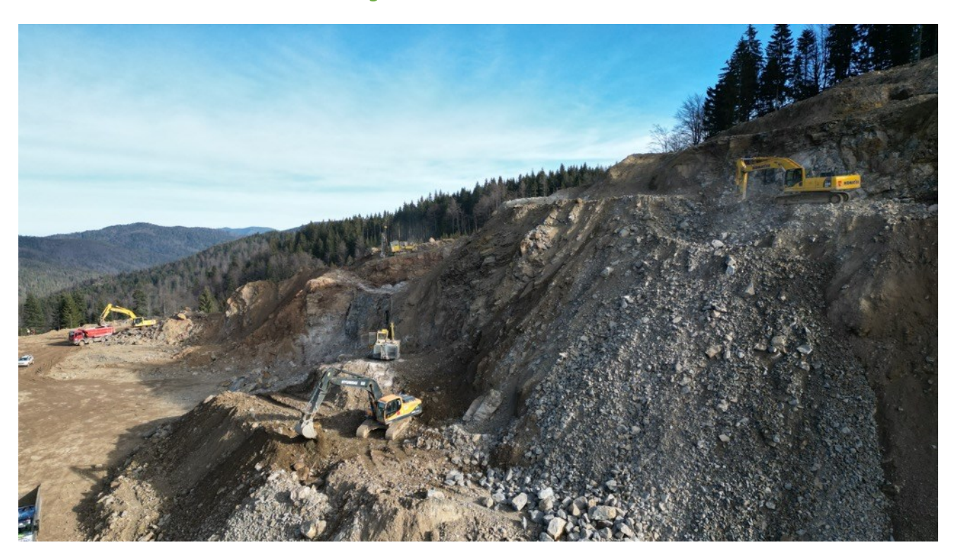
Figure 4: Stockpile