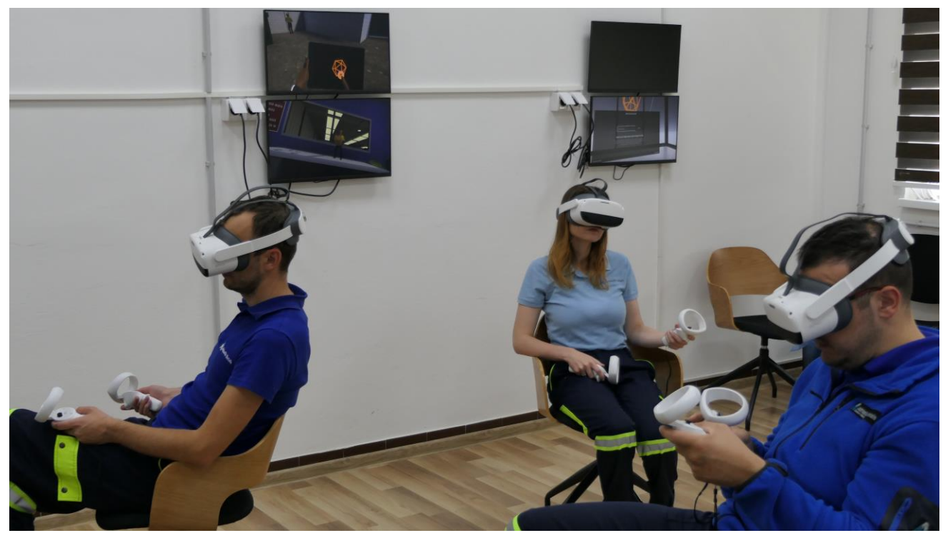
Figure 7: Virtual Reality H&S Training, Vares

The Adriatic team has commenced a safety training program using a purpose-built Virtual Reality training centre offering 13 different simulation modules. The Company has also commenced the development of a safety database to enable electronic workflows through smart tablets and phones, empowering both staff and contractors to report safety matters more efficiently and effectively.