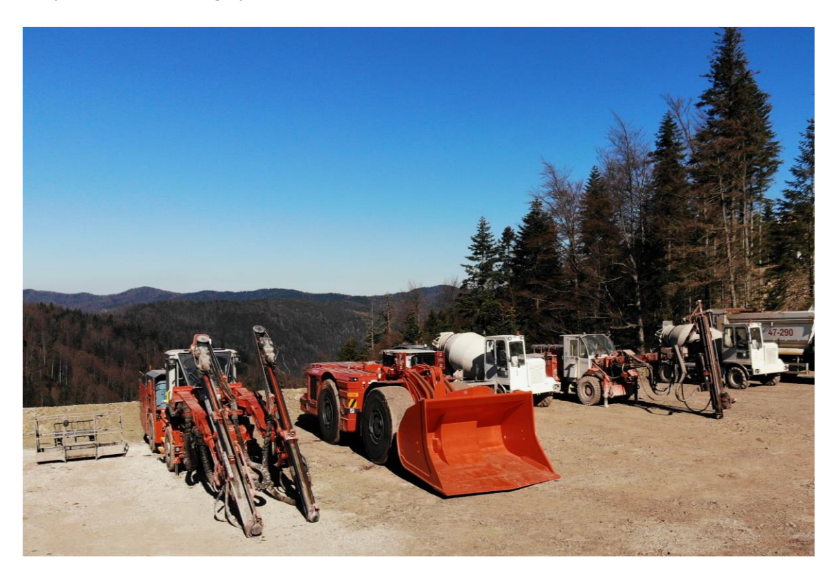
Figure 3: MMC Vehicle Park

gasified emulsion explosives. Non-gasified emulsion does not require storage in a dedicated magazine and therefore removes the requirement to develop a costly underground facility. The existing surface, temporary, magazine in this cost saving scenario can be utilised to store detonators. Non-gasified emulsion also provides better blasting efficiency and reduces blasting gases with the potential to proportionally decrease blasting cycle times.