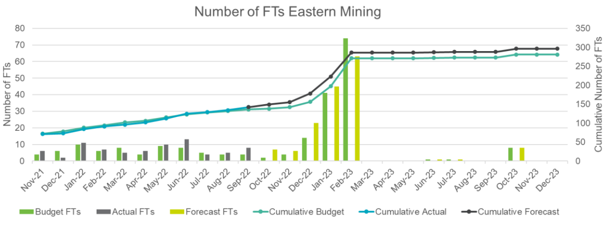
Figure 9: Eastern Mining Full Time ("FT") recruitment 'S' curve

Planning continued for the recruitment of the Processing and Maintenance teams in expectation with the forecasted staffing needs.