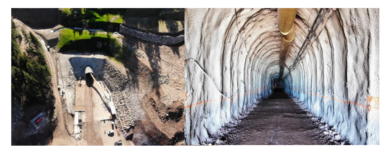
Figure 2: Upper Decline Portal and Underground Development

The Company remains on schedule to open its first stopes in Q2 2023, three months before commissioning of the Vares Processing Plant.