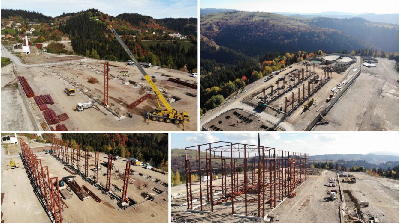
Figure 4: Vares Processing Plant Progress