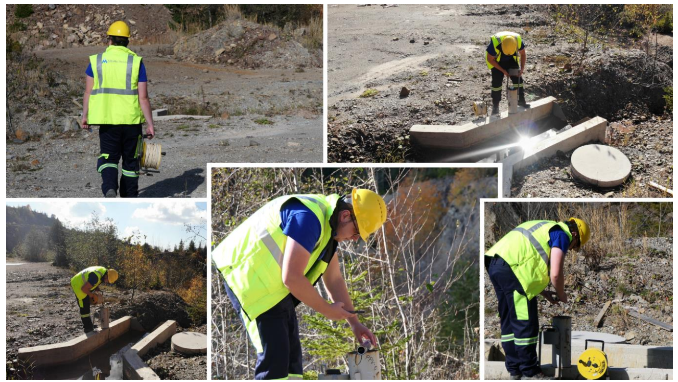
Figure 10: Water testing

The Adriatic Foundation continues to provide free English courses for all applicants from the Vares community. In addition, 30 scholarships for high school and university students have been provided.