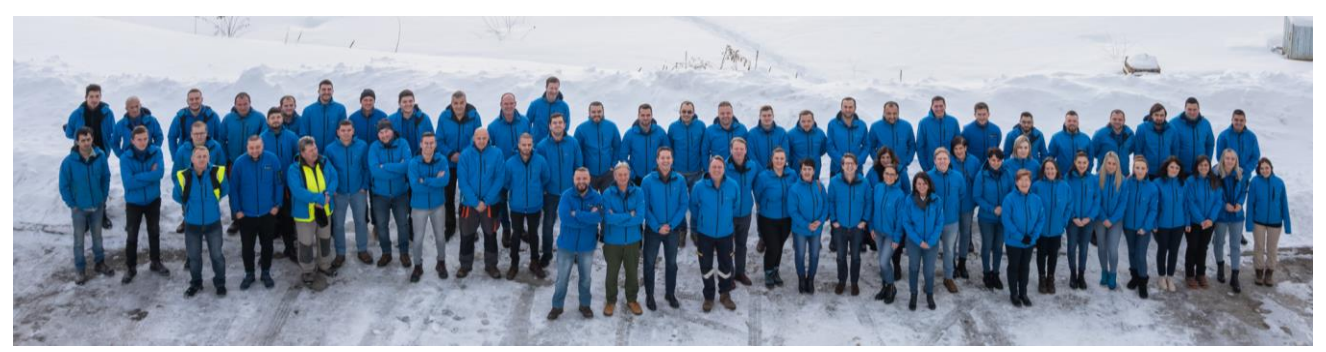
Figure 2: Group photo in Vares, December 2021