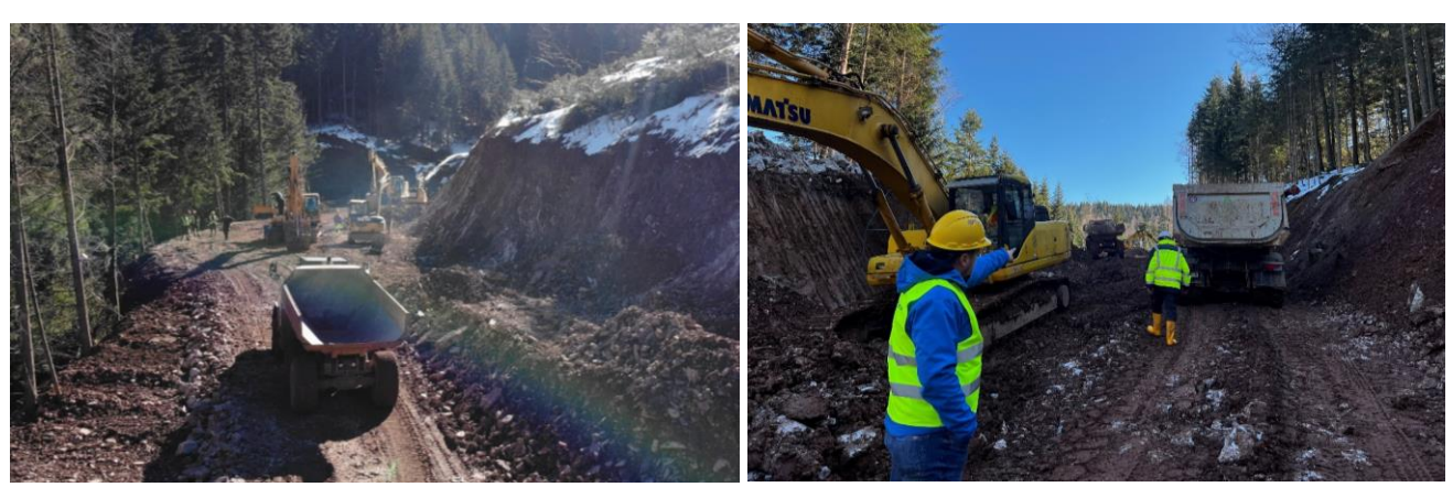
Figure 1: Site clearing and construction of the access road to the lower and upper portals at Rupice

Access road construction at the Rupice Surface Infrastructure site commenced in November 2021 and is progressing well. To date, access road sites have been cleared and a road constructed from the northern access road to Rupice (from Kakanj) to the site of the upper and lower portal pads.