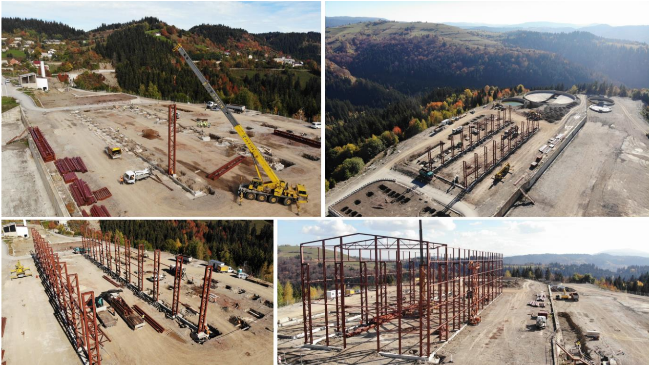
Figure 4: Vares Processing Plant Progress