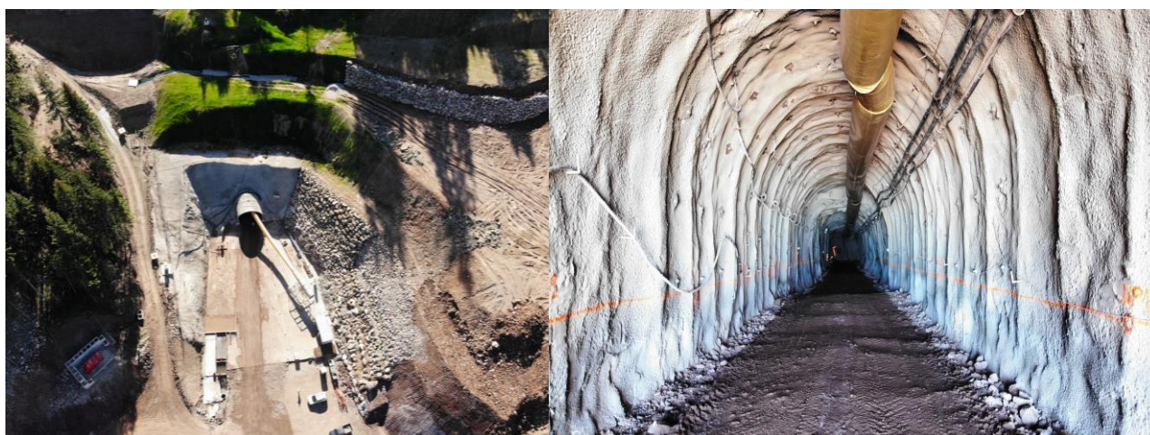
Figure 2: Upper Decline Portal and Underground Development

The Company remains on schedule to open its first stopes in Q2 2023, three months before commissioning of the Vares Processing Plant.