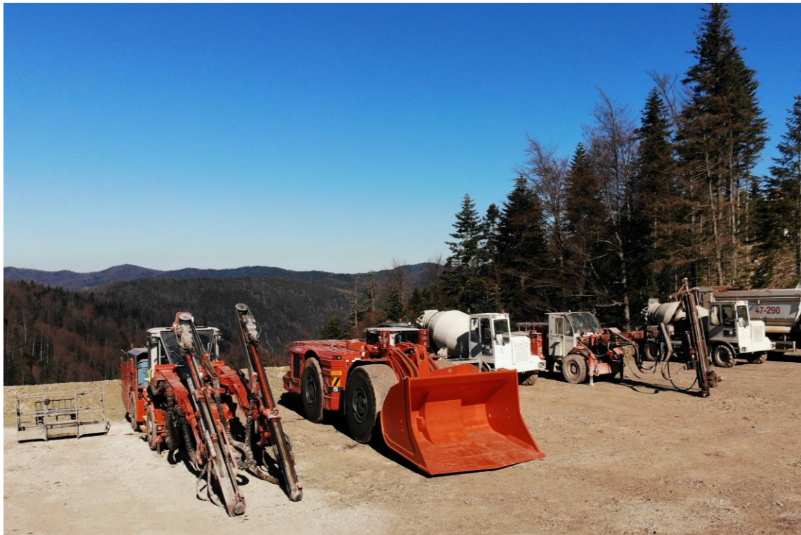
Figure 3: MMC Vehicle Park

gasified emulsion explosives. Non-gasified emulsion does not require storage in a dedicated magazine and therefore removes the requirement to develop a costly underground facility. The existing surface, temporary, magazine in this cost saving scenario can be utilised to store detonators. Non-gasified emulsion also provides better blasting efficiency and reduces blasting gases with the potential to proportionally decrease blasting cycle times.