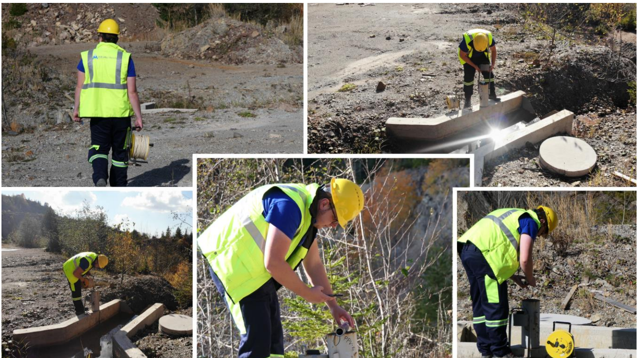
Figure 10: Water testing

The Adriatic Foundation continues to provide free English courses for all applicants from the Vares community. In addition, 30 scholarships for high school and university students have been provided.