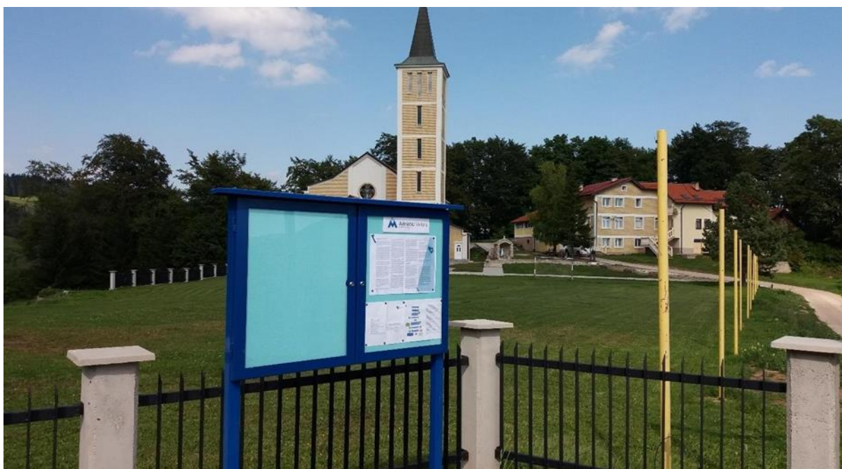
Photo 4.1.2. Notice Board Borovica

Document and reports, such as this SEP, that are too large to display on the notice boards are made available, in Bosnian, at the Info Centre and will be downloadable from the Adriatic Metals website and will be available to or through representatives of local communities.