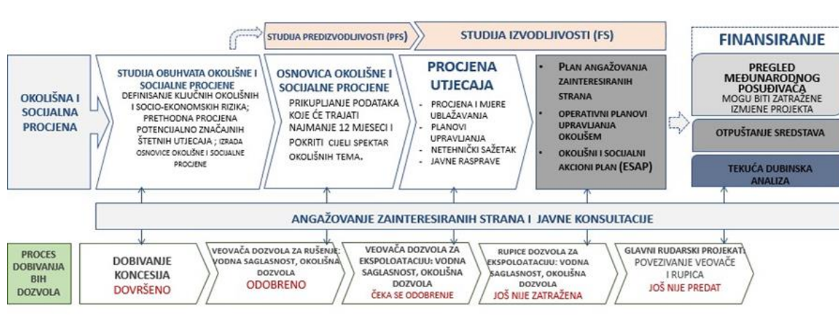
Figure 1. ESIA Process aligned with Technical Studies and BiH Permitting Process

Stakeholder consultation is a vital component of the ESIA process and technical studies (Figure 4.1). Consultation was initiated during the scoping study for the ESIA and has continued throughout the baseline period and once the impact assessment documentation was completed in draft. Key stakeholders were being identified and interviewed as part of this process and engagement with them was and is ongoing.